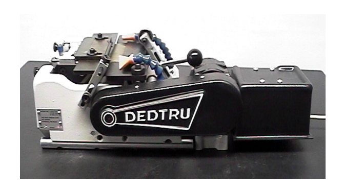
Model IGF Internal Grind Fixture